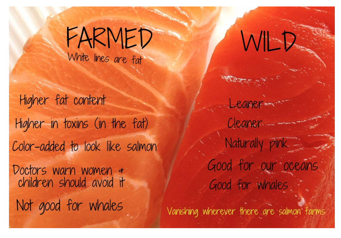
HIGHER FAT CONTENT

Farmed salmon has much higher fat content than wild salmon, because they are fed a high-fat diet designed to make them gain weight as fast as possible. This graph shows some of the data on fat in farmed vs wild salmon. Data is from the USDA.